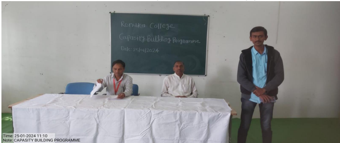
Time: 25-01-2024 11:10 Note: CAPACITY BUILDING PROGRAMME