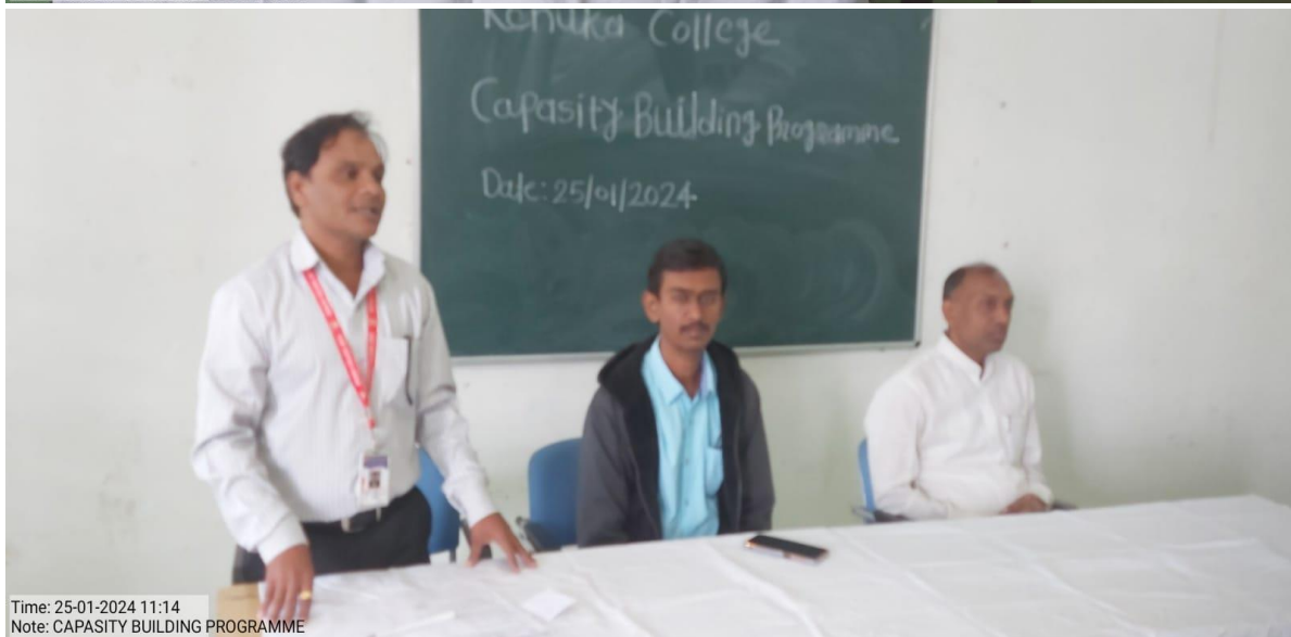
Time: 25-01-2024 11:14 Note: CAPACITY BUILDING PROGRAMME